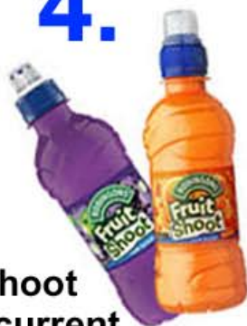
Fruitshoot Blackcurrent or Orange